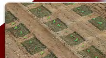
AT TIME OF THINNING