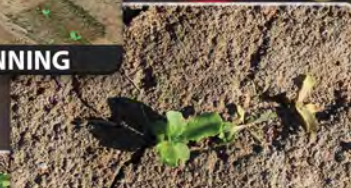
ONE DAY AFTER THINNING